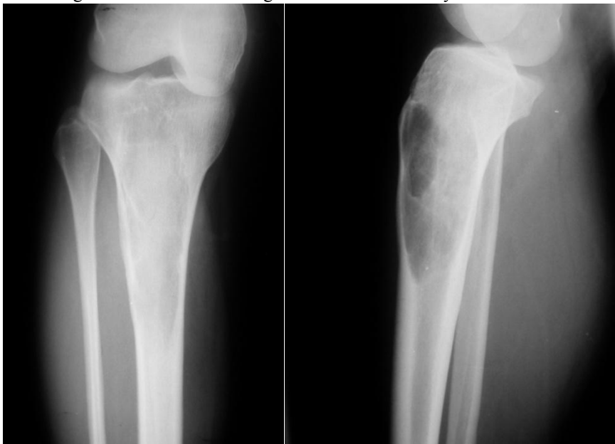
Fig 1, A and B; X-ray of the right tibia showing metaphyso-diaphyseal cystic lesion of the proximal tibia.

cortex at some levels, but it did not reach the articular surface, nor the surrounding soft tissues. Decision was taken to biopsy it. The pathology report showed lamellated cysts and scattered scoleces. Albendazole was given 400 mg PO twice for 2 months. A second operation was made with extensive curettage, then extensive excision of bone layers with burr, then phenolization and bone grafting of cancellous chips inside the cavity. The patient was free radiologically of the disease for two years, then in the third year, multilocular cysts reappeared on xray (fig 4), with possible extension to the articular surface. A decision of total knee arthroplasty was taken after wide resection of the diseased segment (fig 5). Negative margins were obtained. The patient post operatively was rehabilitated; pain subsided with no radiological signs of recurrence. She was given albendazole 400 mg bid for 3 months orally.