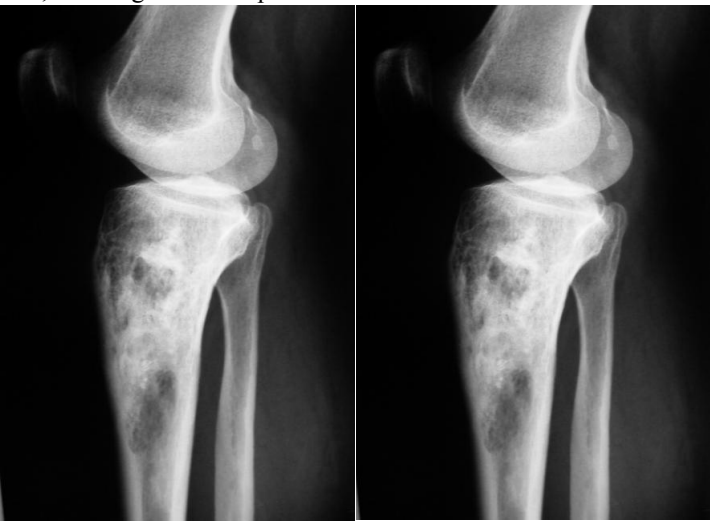
Fig 4, A and B; Three years after curettage and bone grafting, multiloculated osteolytic lesions of the proximal tibia extending to the cartilage.